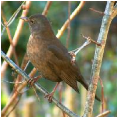
Birds building nests

Look out for these shiny yellow flowers and heart-shaped leaves covering woodland floors.